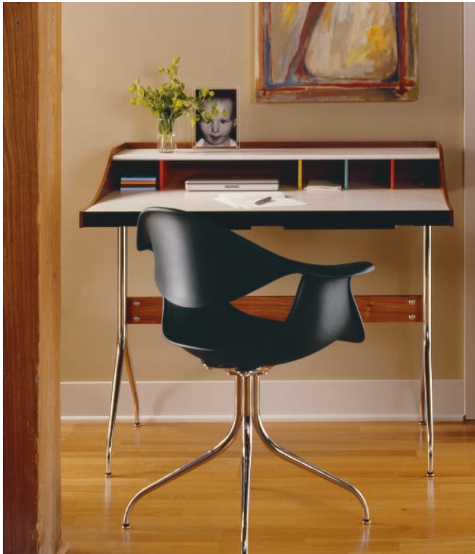
A Nelson swag leg chair is shown here with a swag leg desk, which, along with work and dining tables, completes the Nelson swag leg group.

One early observer, commenting on the swag leg chair's base, said it "grows up like four tree roots and unites into one strong upward thrust." The base may recall roots, but the chair's shell echoes another familiar form. George Nelson borrowed (with permission) the patented process for molding plastic that Charles and Ray Eames developed. He added a twist, however: Nelson created separate seat and back shells and then glued them together. The result is a sculptural shape that fits the body and provides a bit of give. Placed around tables in dining areas or conference rooms, this chair fits today's needs just as it did when it first appeared in 1958.