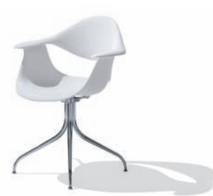
Nelson Swag Leg Chair